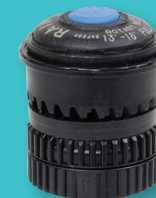
R1318F (4.0m to 5.5m)