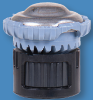
R-VAN14 (2.4m to 4.3m)