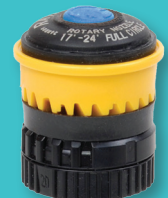
R1724F (5.2m to 7.3m)