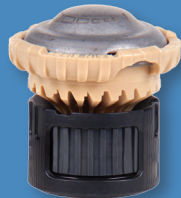
R-VAN18 (4.0m to 5.5m)